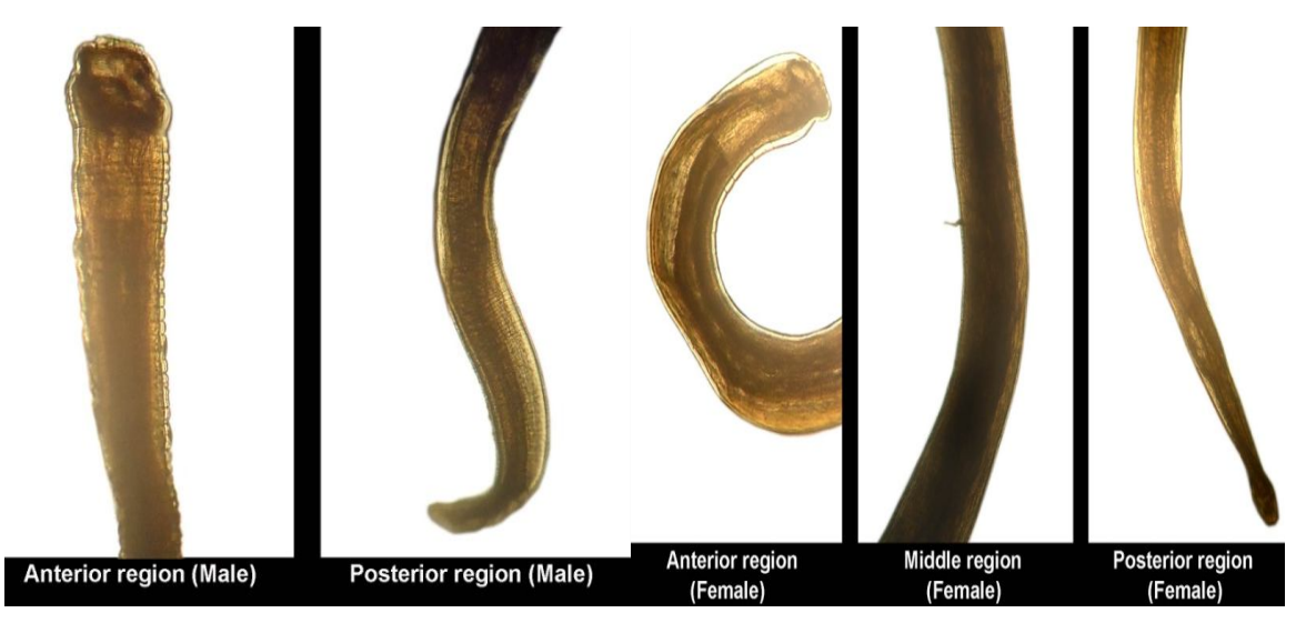
Fig. 1: Photoplate of Camallanus oxycephalus Ward and Magath, 1916

longitudinal ridges and measures 0.589(0.561-0.618) in length and 0. 674 (0.427-0.921) in width. Tridents are present. Nerve ring surrounding the muscular portion of oesophagus, measures 0.101 (0.089-0.112) in length and 0.370 (0.359-0.382) in width and lies at 1.5056 mm from anterior extremity. Excretory pore lies at 2.870 mm from anterior extremity. Oesophagus consisting muscular and glandular parts and measures 2.415(2.359-2.471) in length and 0.393 (0.337-0.449) in width. Caudal papillae are eleven paired, out of them five pairs are pre-anal and six pairs are post-anal in position. Spicules are unequal and dissimilar in shape. The right spicule is small and measures 0.438(0.427-0.449) in length and 0.0281 (0.0225-0.0337) in width, while left spicule is long and measures 0.662(0.651-0.674) in length and 0.0281 (0.0225-0.0337) in width. Tail is curved, pointed and measures 0.966(0.898-1.033) in length and 0.269 (0.134-0.404) in width.